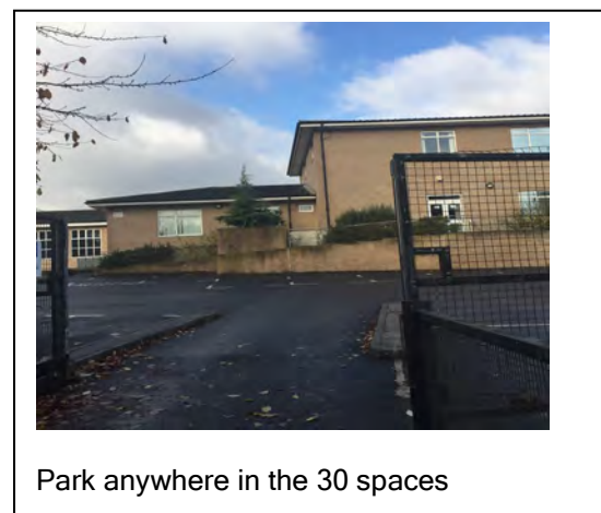
Park anywhere in the 30 spaces

Exit the car park Drive into Tile Farm Road and park anywhere appropriately near the shops. Kindly ensure not to block anyone's driveway. Walk into Sandybury Lane.