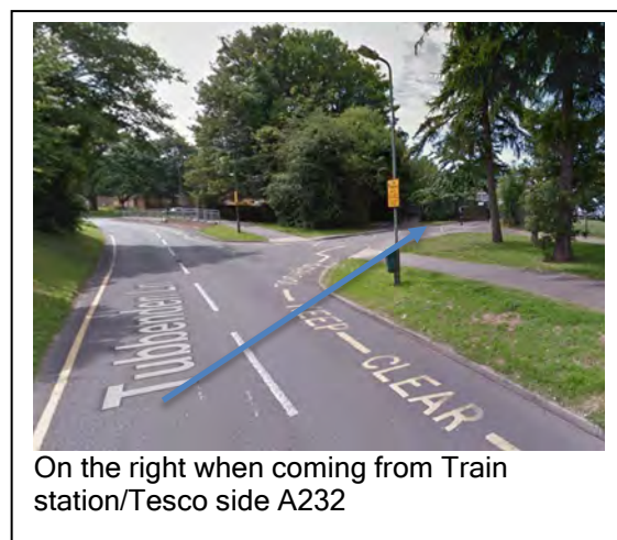
On the right when coming from Train station/Tesco side A232