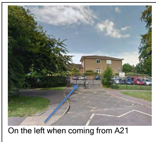
On the left when coming from A21

School Main Entrance at Tubbenden Lane (To be used)